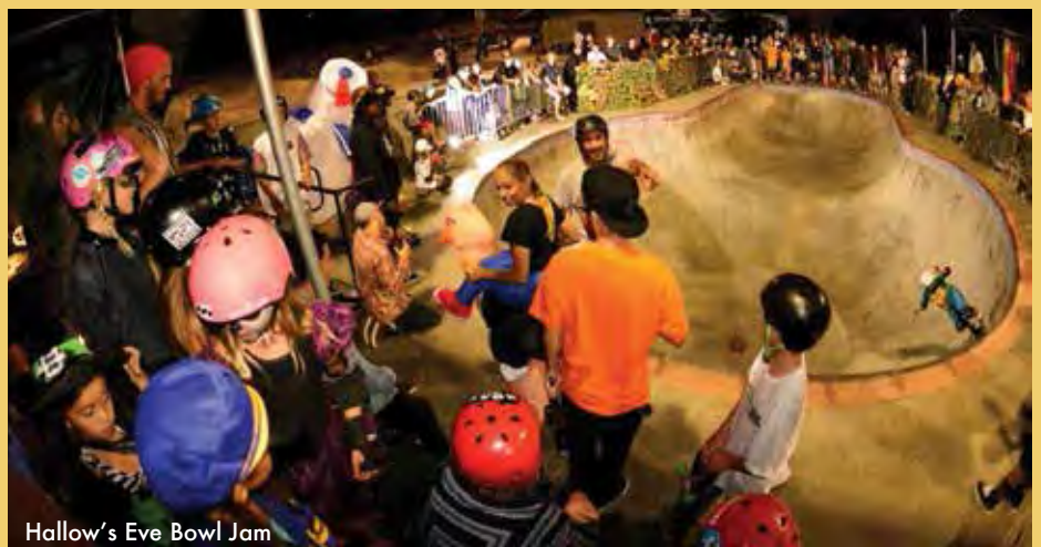
Hallow's Eve Bowl Jam

For more information call Community Services at 461-3450 or the Sports Park at 273-6960