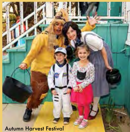
Autumn Harvest Festival

Fee: $5 per person Additional fees for games