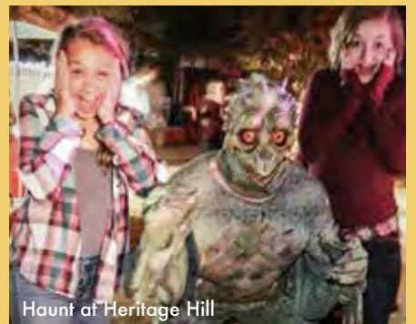
Haunt at Heritage Hill

For more information call Community Services at 461-3450 or the Sports Park at 273-6960